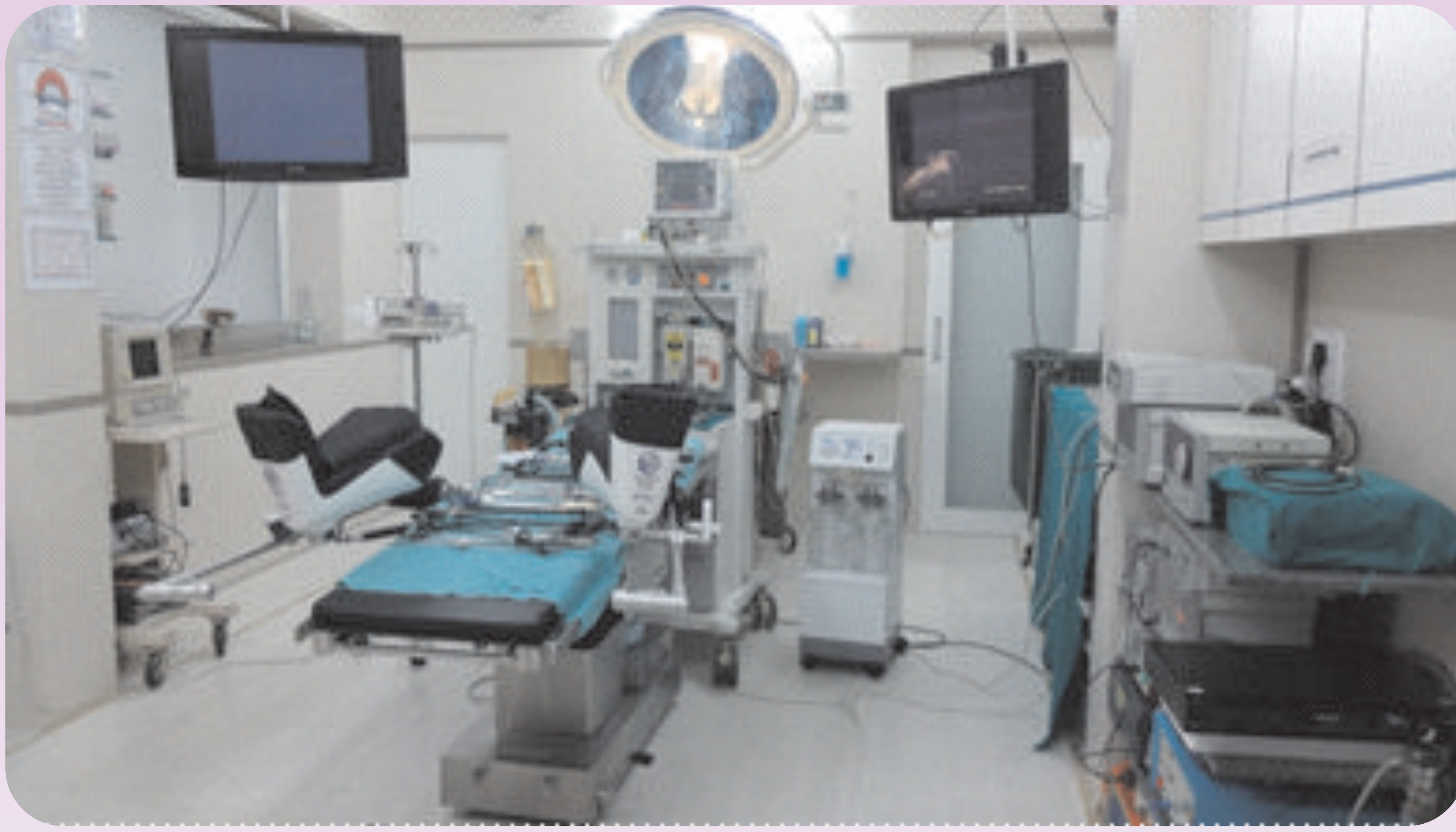
3D OT Setup with Allen Stirrups with 3D Monitors