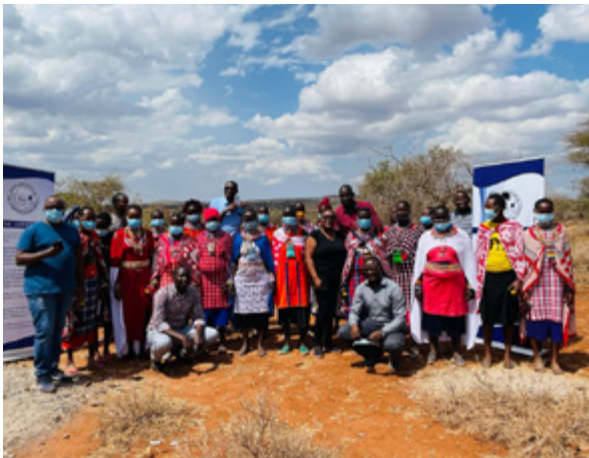
KOGS workshop with the Maasai community on unsafe abortion