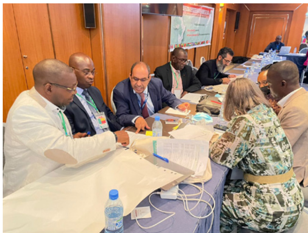
SAGO meeting on strengthening access to safe abortion care, 2022