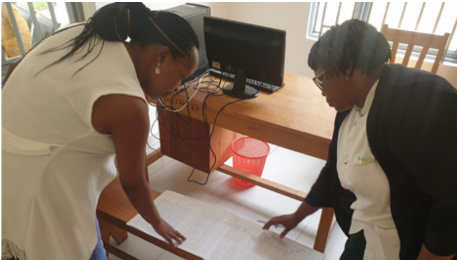
Midwife shows the success of Telemedicine & Task-sharing study, Rwanda